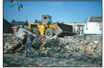
Demolition work underway at Tow Law

In 1985 the Rural Development Commission (RDC) launched a new programme to encourage multi-purpose village centres. New services would operate alongside traditional uses under one roof, making best use of the buildings. This seemed to fit the bill for Tow Law where the old centre had been condemned as unsafe, but where would the money come from? In the hope that a grant would come from the RDC, the community came together to form a fundraising project group with advice and support from Durham Rural Community Council.