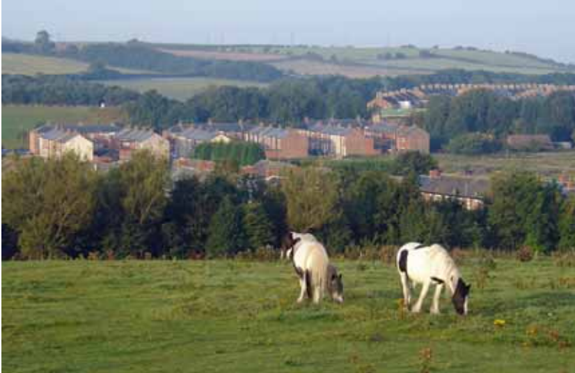
Pictured: view across the Dene Valley towards Coundon Grange and Eldon Lane

A glance down the list reveals the names of many villages that continue to exist today – without pit heaps or the scars of mining. Auckland Park, Coronation, Coundon Grange, Close House, Eldon Lane, Gurney Valley, Old Eldon and Eldon were amongst them.